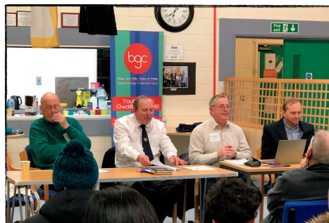
58 attendees at our AGM that was held in January 2023. We hosted at Treharris BGC where we also celebrated its 100th anniversary – our first Boys and Girls Club established in Wales!