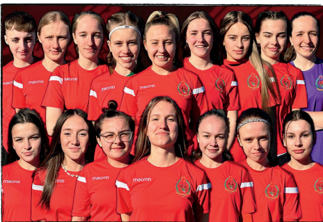
Match Day (21/11/22) USA 2 - 0 BGC Wales

We were awarded funding by the Welsh Government and we arranged a trip for 32 young people, all aged under 15, and support staff to travel to Boston in America , to play matches against an American representative team on the same day the Welsh Men's National Team played against the USA Team at the World Cup in Qatar. The purpose of this trip was to provide a life changing opportunity for young people from Wales and for them to test their skills in another country.