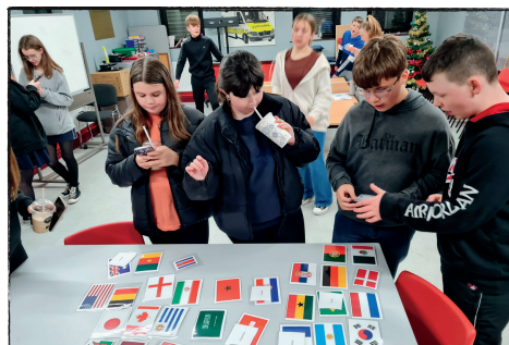
Inter-club competitions, youth-led activities, social media safety, eLearning, Youth Forum, volunteering project