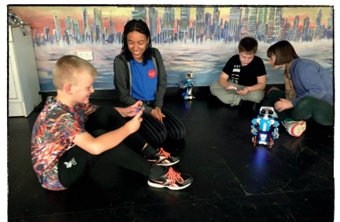
Meet and Code, Sport Leadership, Football against Racism, Politics project, outdoor activities.