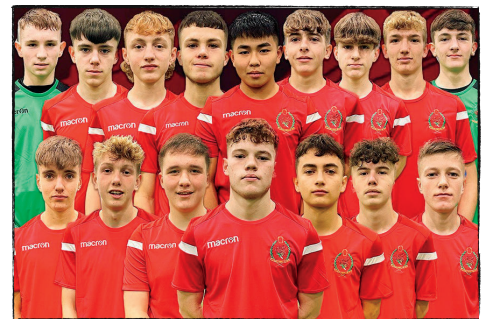
Match Day (21/11/22) USA 0 - 3 BGC Wales

At home in Wales, 44 member clubs hosted watch parties and football related activities, creating a Welsh footballing legacy in clubs with attendance of 3631 young people.